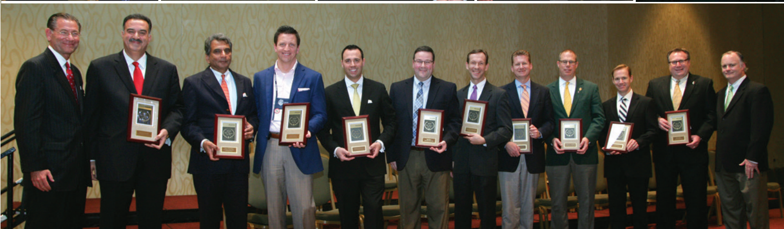
Club presidents or club general managers accepting on behalf of the club presidents at the 2013 Top Private Club Presidents reception at the CMAA World Conference and Expo in Orlando, FL this past February.